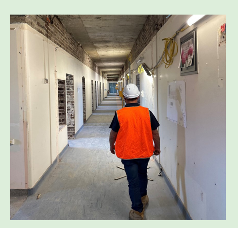
The former hospital building, Milton Park is looking very different on the inside!

Allied Health services and therapy spaces for physiotherapy, speech pathology, cardiac rehabilitation/ diagnostics, occupational therapy, social work and dietetics;